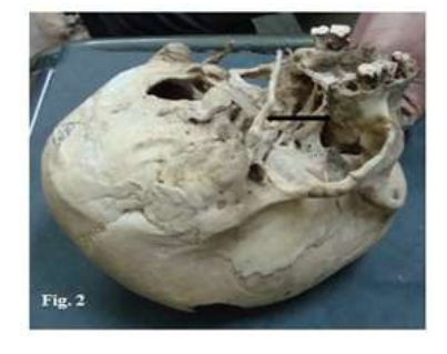
Fig. 2: Photograph showing elongated styloid process (unilateral)